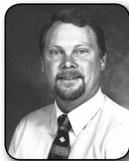
Paul Brown Event Management